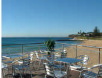
Relax on the balcony and take in the views.

Please turn over to complete application